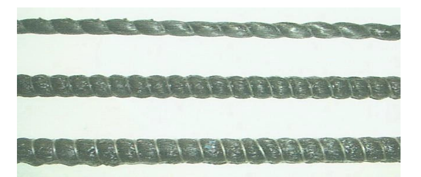
Fig. 1. Different options for creating a corrugated surface for BPR based on the use of a braid thread to create increased adhesion to concrete

We found that the presence of a braiding thread and dents on the surface of the BPA greatly increases the adhesion of basalt plastic reinforcement to concrete, and later it was found that the increase occurs 3-4 times.